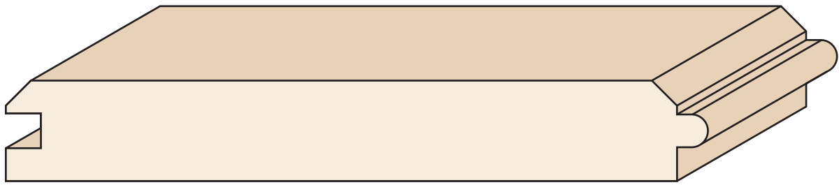
24160-TVG \frac{3}{4} " x 5" (face)